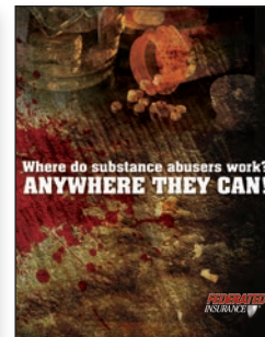
Drug- and Alcohol-Free Workplace Program

Yes! I would like to receive complimentary risk management materials from Federated Insurance.