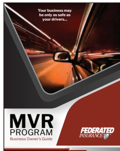
Motor Vehicle Records