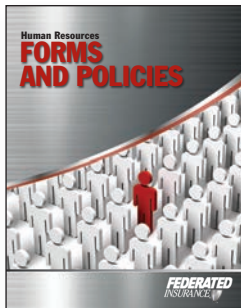
HR Forms and Policies