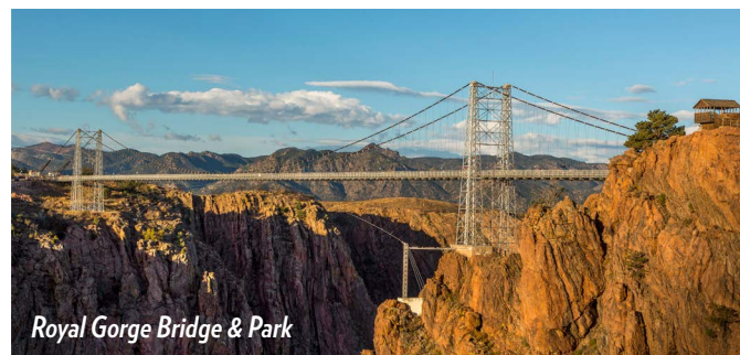
Royal Gorge Bridge & Park