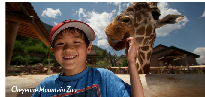
Cheyenne Mountain Zoo

For a complete list of things to see and do in the Pikes Peak Region, head to