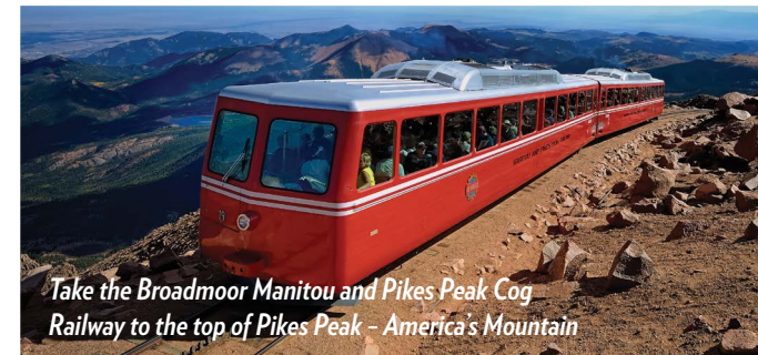
Take the Broadmoor Manitou and Pikes Peak Cog Railway to the top of Pikes Peak - America's Mountain