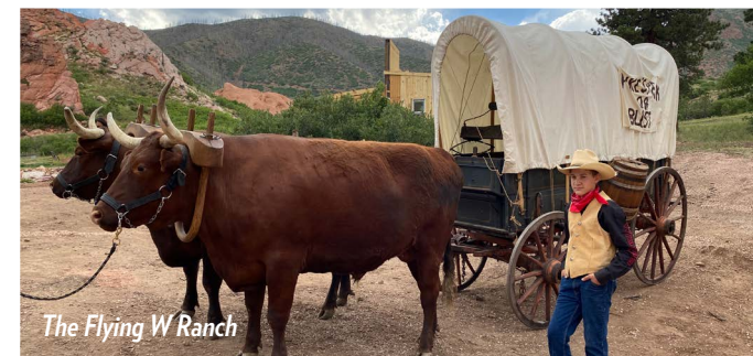
The Flying W Ranch