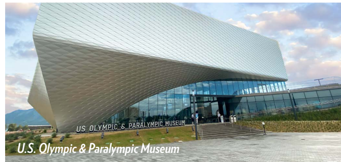
U.S. Olympic & Paralympic Museum

Explore all the wonderful things there are to see and do while you're here.